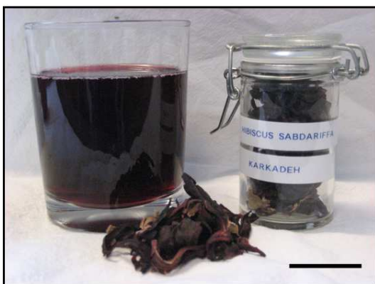
Fig. 1: Dried petals of Roselle, known in Arabic as “Karkadeh” ( Hibiscus sabdariffa Linn)-collected from the Aswan region of Egypt. The photo was taken using a Canon Digital Ixus 60 camera with 6.0 megapixel resolution, on the 30th of April 2008; shutter 1/60, f/3.5, focal length 8.4 mm. Scale bar = 5 cm

In Egypt, during the hot summer months, numerous traditional drinks such as karkadeh are consumed and are known to have a beneficial effect on human health [16] . However, a decreasing preference for the old and more traditional ways and a move towards an increasing use of commercially produced carbonated drinks, soft drinks and fruit nectars has resulted in elevated blood glucose levels with deleterious effects to the health and well-being of the general populace [16] .