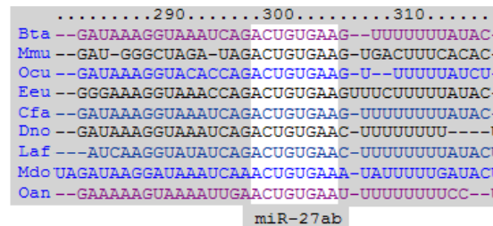
Fig. 2: Highly conserved miRNA target site in the 3'UTR region of the TFAM gene identified using TargetScan software. The miR-27ab specific target region is highlighted. Bta: Bos taurus ; Mmu: Mus musculus ; Ocu: Oryctolagus cuniculus ; Eeu: Erinaceus europaeus ; Cfa: Canis familiaris ; Dno: Dasypus novemcinctus ; Laf: Loxodonta africana ; Mdo: Monodelphis domestica ; Oan: Ornithorhynchus anatinus