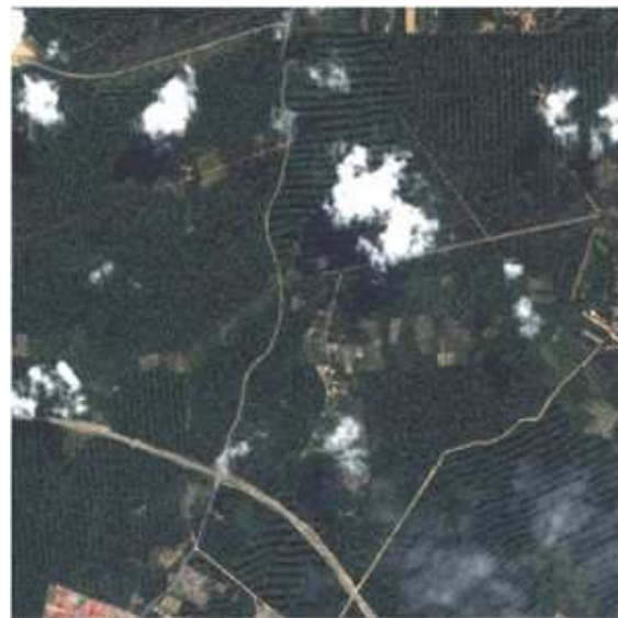
Fig. 2: A QuickBird satellite imagery taken from an oil palm plantation in Merlimau, Melaka, Malaysia

parameters (such as crop cover, crop health and soil moisture) and are useful for operations such as stress mapping, fertilization and pesticide application and irrigation management (Barnes and Baker, 2000; Barroso et al. , 2008; Hinzman, 1986; Lelong, 1998; Pal and Mather, 2003; Singh et al. , 2007; Tilling et al. , 2007; Yang et al. , 2003). Nutrient contents of different crops such as wheat (Lelong, 1998; Silva and Beyl, 2005; Tilling et al. , 2007), paddy rice (Stroppiana et al. , 2008), sorghum (Zhao et al. , 2005), corn (Samson, 2000), broccoli (Shikha, 2007), citrus (Min, 2003), grape (Smart et al. , 2007), apple (Perry and Davenport, 2008) have also been assessed using hyperspectral and multispectral RS data. Interpretation of RS data is often aided by specialized techniques such as geostatistics, image analysis and classification, and artificial intelligence.